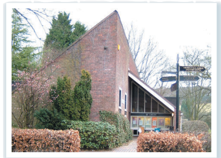
The library at the junction of High Street and Link Road.

2 Great Missenden Library, built in 1970, was visited by Matilda while her mum went off to Aylesbury to play bingo.