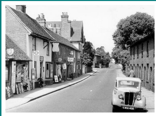
Great Missenden High Street, circa 1950