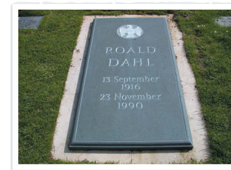
Roald Dahl's gravestone. Follow the BFG's footprints from the commemorative bench to find it.

8 There is evidence that there was a church on the site of the parish church of St Peter and St Paul as early as 1133. When Roald Dahl died in November 1990 he was buried here.